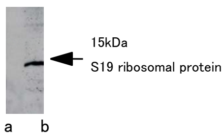
a: Non immuned rabbit antibody b: Anti S19 ribosomal protein antibody

Detecting S19 protein in HepG2 Cell Homogenate