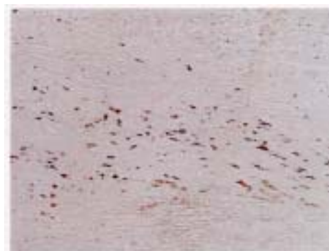
Immunohistochemical staining of the early stage of human atherosclerotic lesions of the aorta with anti-AGEs antibody 6D12.

Clinical nephrology , Vol.42, 354-361, 1994